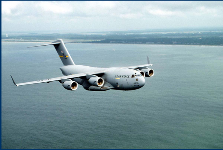
A Boeing C-17 Globemaster III In Action.

"The Globemaster III, now in its 15th year of service, continues to be recognized as the backbone of international airlift missions, supporting numerous contingency, humanitarian relief, and peacekeeping efforts around the world."